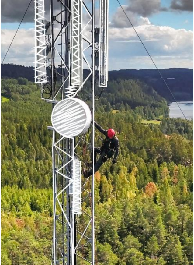
Investment in fast connectivity